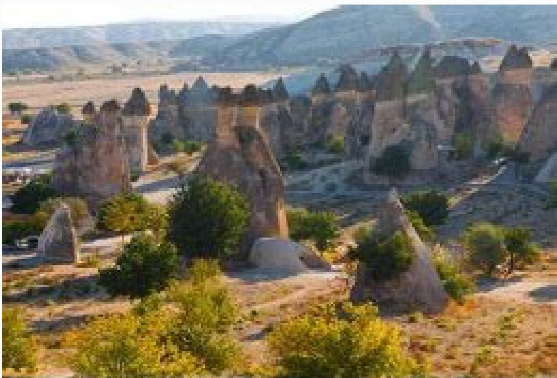
Istanbul visitors guide. Visit istanbul. Visit turkey.